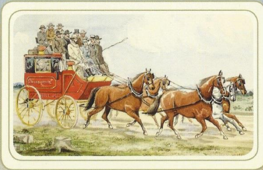
People travelled between towns in crowded, bumpy coaches.

To go on a long trip, families caught a horse-drawn Cobb & Co. coach. These coaches travelled between major towns, carrying passengers, mail and newspapers. Travelling in a coach wasn't comfortable as it was hot, dusty, crowded and bumpy. And sometimes it was dangerous, because bushrangers often ambushed the coaches, stealing the mail and the passengers' valuables.